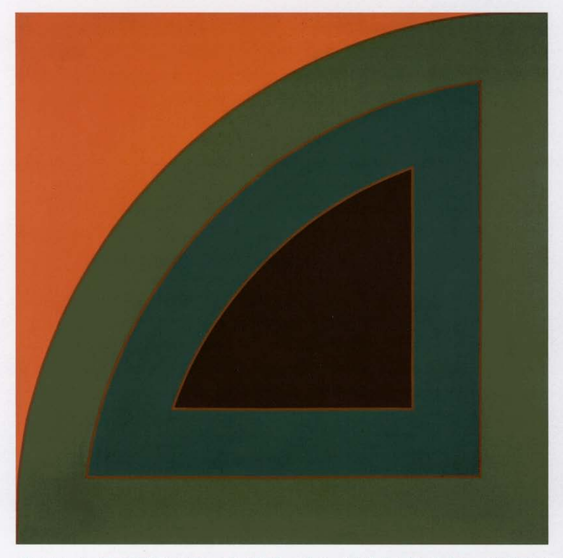
COLLECTING ART IN KANSAS CITY

Kemper Museum of Contemporary Art • September 7-November 4, 2007